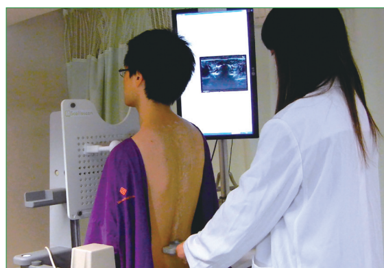
基於三維超聲的脊柱側彎的評估 3D ultrasound imaging for spine scoliosis

特發性少年脊柱側彎是小孩中最常見的一種脊柱變形，其發生率為2 - 4%。用X光成像來測量脊柱的彎度是目前最常用的評估方法。但是由於X光的輻射有害，且不可頻繁使用，尤其是對年輕的女性，所以在脊柱側彎的治療過程中很難有連續的效果評估。因此，基於三維超聲成像技術，我們開發了一套沒有輻射的脊柱側彎評估系統。