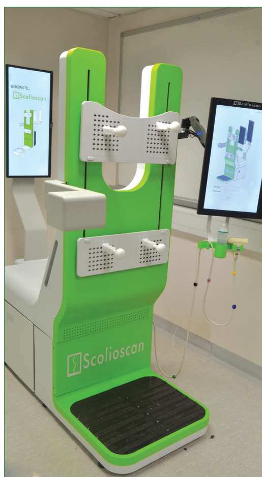
用具有空間定位的超聲探頭來採集患者脊柱的三維超聲圖像 Collection of 3D ultrasound images from the subject using an ultrasound probe with spatial sensor