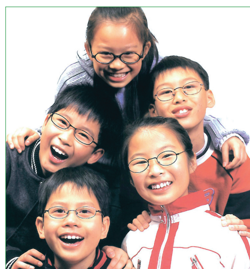
控制兒童和青少年的近視加深速度 To retard the progression of myopia in children and youngsters

Tel: (852) 3400 2929 Fax: (852) 2333 2410 Email: pdadmin@polyu.edu.hk